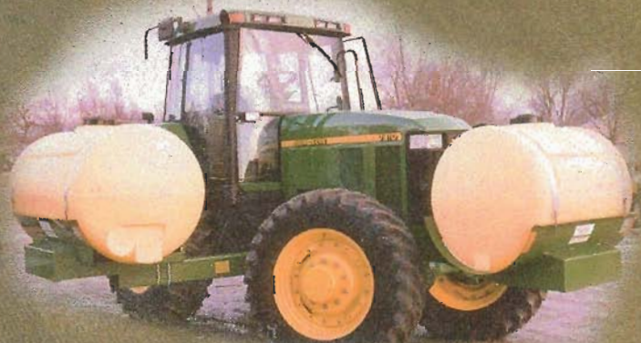
JD 7000 Series