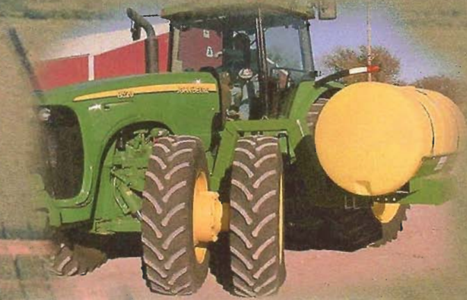
JD 8000 Series w/front Duals