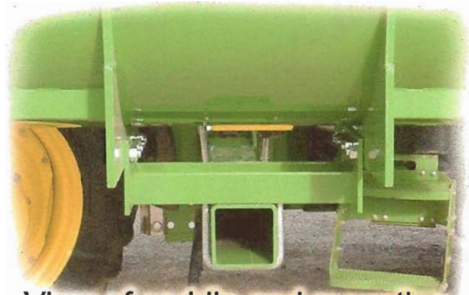
View of saddle and mounting conversion on 8" square tube with 1/2" thick wall