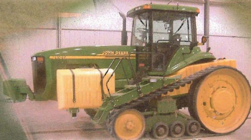
JD Wide Trac Inside Poly Mounts