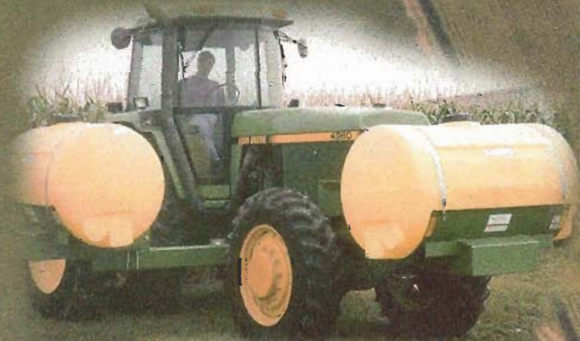
JD 30 - 60 Series