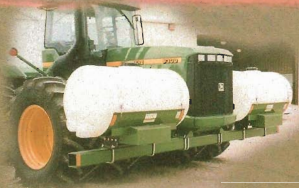
JD 4 Wheel Drive