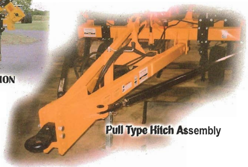
Pull Type Hitch Assembly

1 1/4" x 7" Heavy duty shank available 3 - 15 shank available, 3 point or pull type