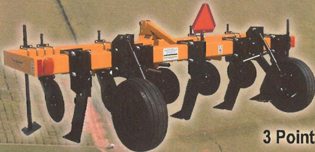
3 Point “Mulcher”

FIELD TESTED, USER APPROVED DESIGNED TO FIT YOUR NEEDS REDUCE PROFIT ROBBING COMPACTION