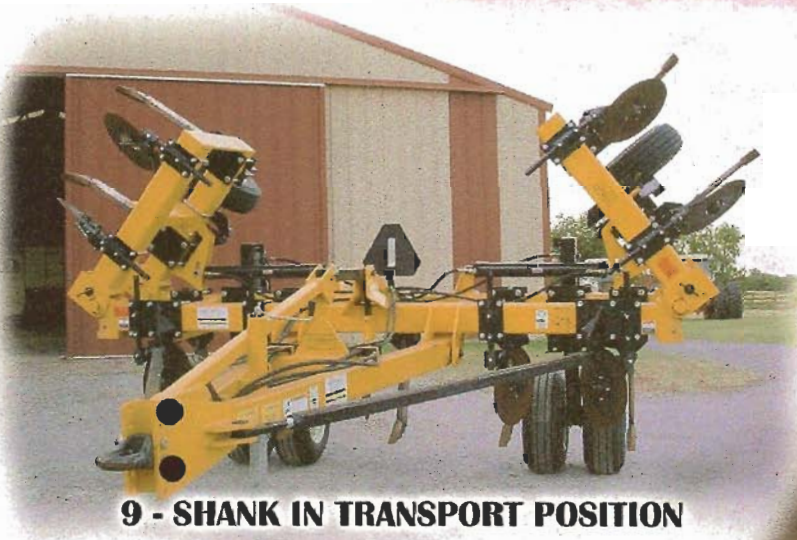
9 - SHANK IN TRANSPORT POSITION

1 1/4" x 7" Heavy duty shank available 3 - 15 shank available, 3 point or pull type