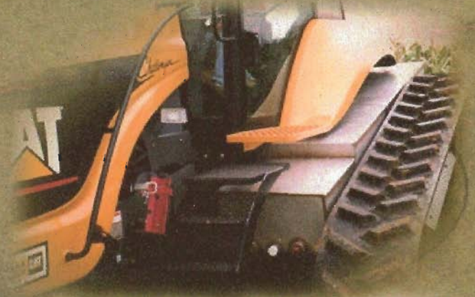
Special Order Stainless Steel Inside Mounts