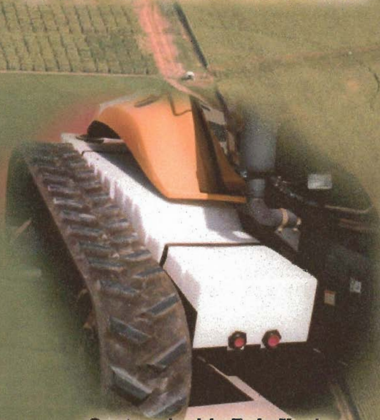
Custom Inside Poly Tanks