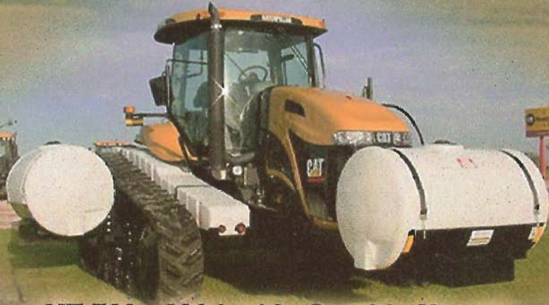
MT 700 - 800 Inside Outside Mounts