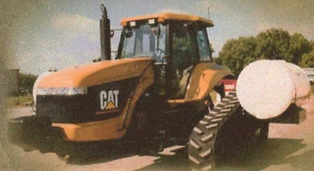
Outside Poly Tanks